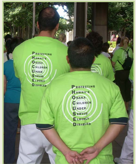
The famous PHOCUSED green t-shirts. A hot item at the State Capitol!!

We are ever grateful to the following for supporting our efforts: