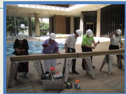
A Capitol Campaign by Habitat

Habitat for Humanity provides a low cost, simple, doable, elegant solution to housing problems in Hawai'i and worldwide.