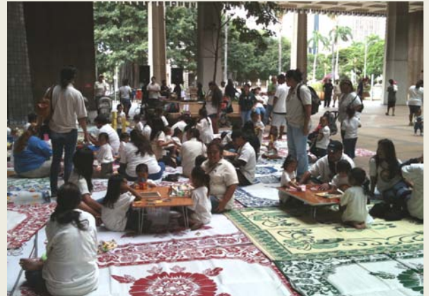
Partners In Development keiki and families sitting and singing in support of services